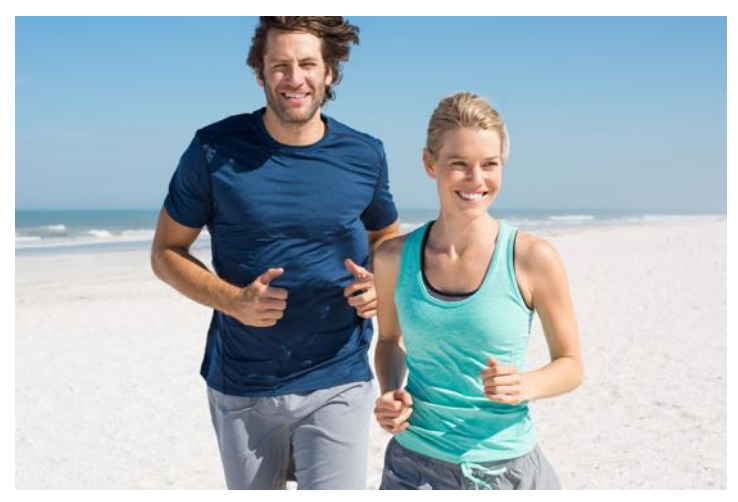
I ticked a box and I want to get back to doing what I love – what do I do next?

Take control of your back pain before it starts to control you and keep you from doing the things you enjoy.